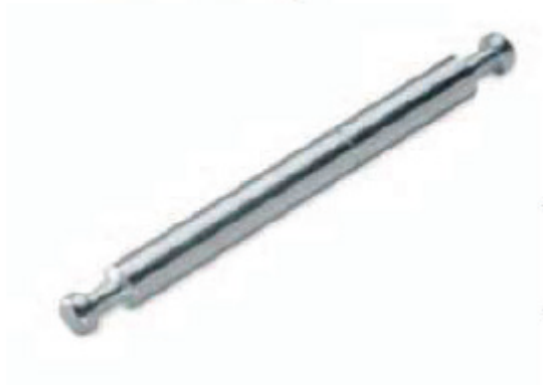
Dowel without circlip